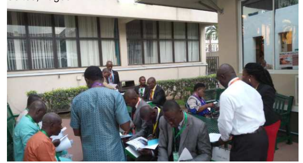
Teachers at the training American International School, Lagos