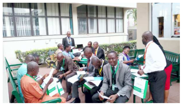
Teachers at the NISC conference held at American International School, Lagos