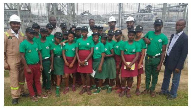
Students of Comty. Sec. Comm School, Ikot Ebiere, Onna & Comty Sec School, Odorotatn, Ikot Abasi