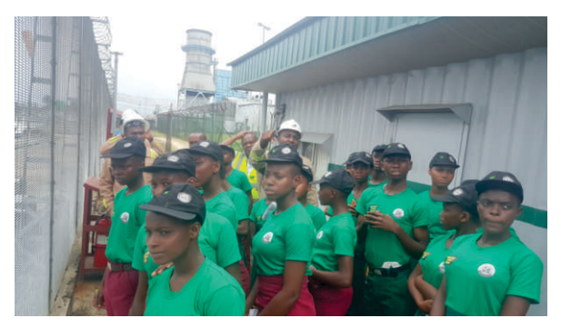
A tour of Seven Energy's Gas Plant in Ikot Abasi