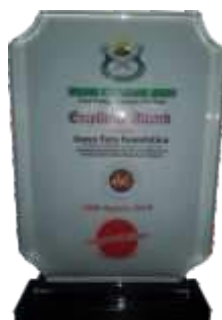
Award given by Mboho Mkparawa Ibibio