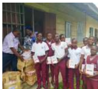
Exercise books donated to the students of MSSC Oron by their mentor