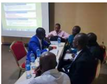
Interactive session during the ITF Capacity training