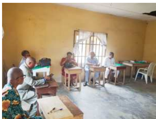
A cross section of principals during the 2019 screening

"Research shows that there is only half as much variation in student achievement between schools as there is among classrooms in the same school. If you want your child to get the best education possible, it is actually more important to get him assigned to a great teacher than to a great school"