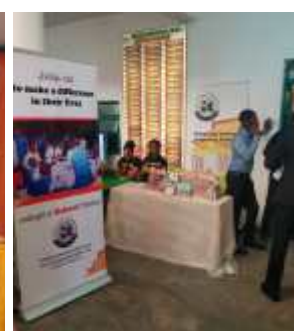
ITF exhibition stand during the 1st Education Summit in AKS

“Let us remember: One book, one pen, one child, and one teacher can change the world.” - Malala Yousafzai