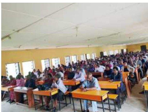
Teachers being addressed during the 2019 screening test