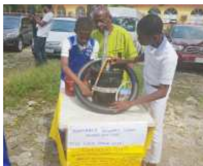
A display by some student of Govt. Sec. Sch Afaha Eket