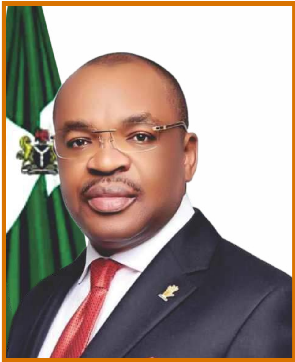
His Excellency MR. UDOM EMMANUEL GOVERNOR, AKWA IBOM STATE