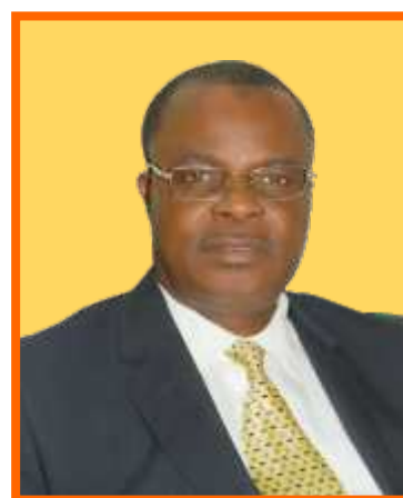
PROF. NSE ESSIE

Hon. Commissioner, Ministry of Education, Akwa Ibom State